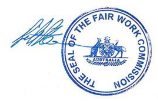
DELEGATE OF THE GENERAL MANAGER

Printed by authority of the Commonwealth Government Printer