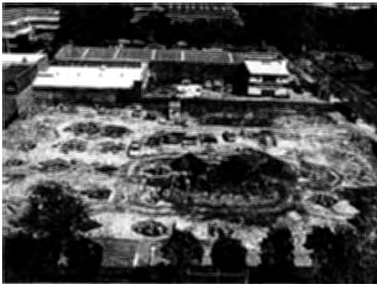
AIPA's new home at 247 Coward Street takes shape. Photo taken 6/10/04.

AIPA has undertaken to advance the necessary funds to enable the contract to be completed.