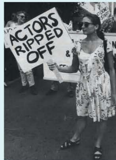
Georgie Parker at an Equity protest in 1993.

I remember when I started out as an actor at 18, that it was a glorious thing to not only be employed, but to have the opportunity to be able to audition for a role.