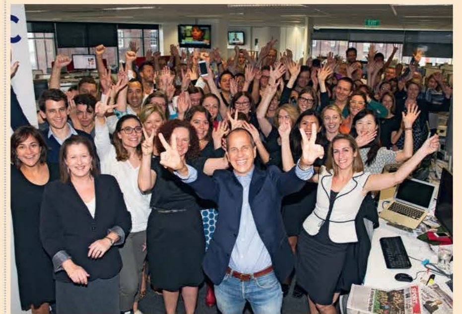
Peter Greste visits the Sydney Morning Herald following his release from an Egyptian prison.

The Tasmanian Government briefly considered reintroducing the ability for corporations to sue for defamation but, as MEAA reminded the state Attorney-General, this would have required the approval of all jurisdictions under the uniform defamation law regime. The proposal was eventually abandoned.