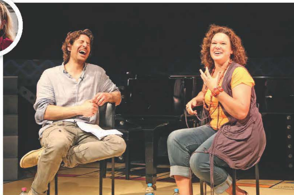
Actor Don Hany and actor/writer/director Leah Purcell in conversation at a conference to mark Equity's 75th birthday at the Sydney Theatre Company in October 2014.

Quartets, Noirhouse, Zombies on Ramsay Street, Mychonnny, Harold the Musical.