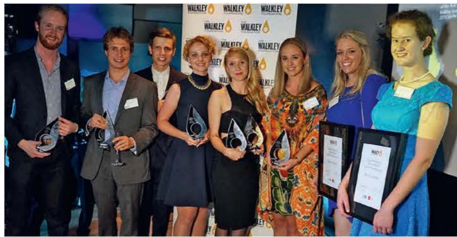
Winners at the 2014 Walkley Young Journalist of the Year Awards.

Industry change has meant the Walkley program has had to diversify. Our traditional role of benchmarking and promoting excellence in journalism is more important than ever. But now we are also directing our resources into two vital areas: first, helping