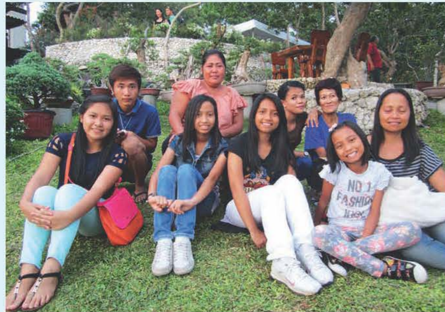
The children of those killed in the Ampatuan Massacre have gone through school with the help of MSSF funding.

The Media Safety and Solidarity Fund is supported by donations from Australian journalists and media personnel to assist colleagues in the Asia-Pacific region through times of emergency, war and hardship.