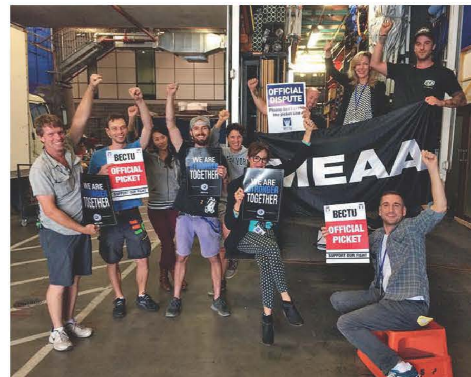
MEAA crew on the set of Wonderland show solidarity for their fellow unionists at BECTU.

This has resulted in significant growth, member engagement and a change in culture of how the union is perceived in workplaces.