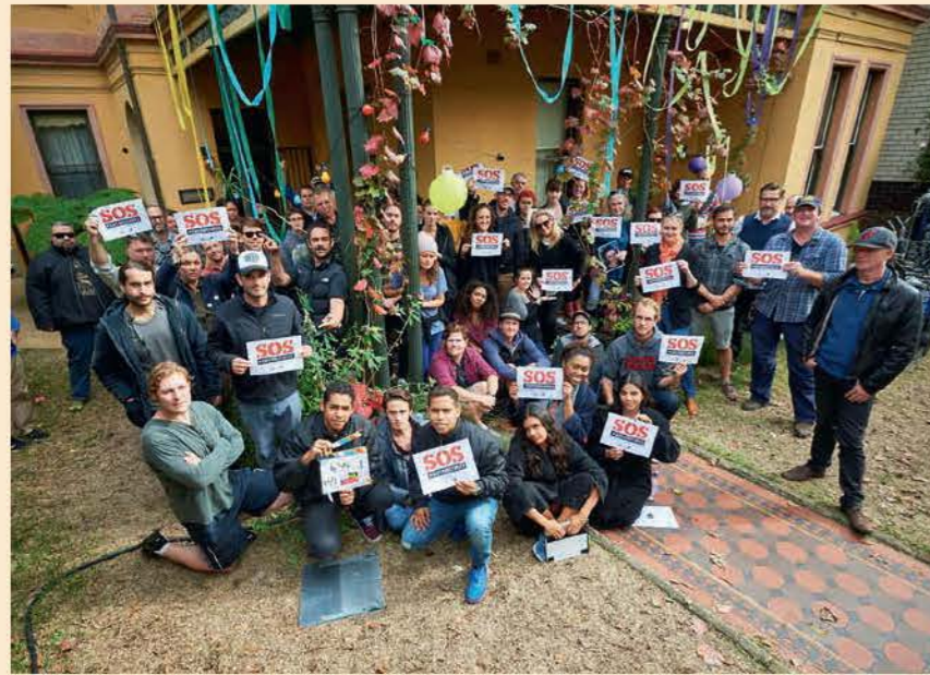
Cast and crew working on TV show Ready for This support the Save Our Stories campaign.

In early 2015 the Federal Government made public a proposal to abolish the rules which regulate the number of foreign performers and crew who can work temporarily in Australia.