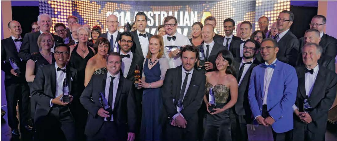
Winners at the 2014 Walkley Awards.