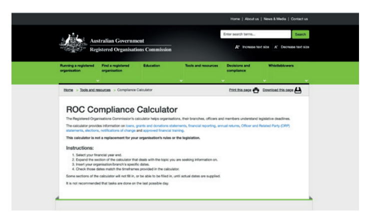
The ROC compliance calculator

A good way to determine when you need to lodge information with the ROC is to consult our <u>compliance</u> <u>calculator</u> because it will give you due dates specific to your organisation or branch.